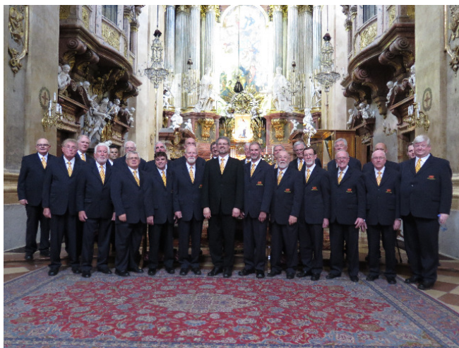
Formed up in the Peterskirche ready to perform. Monday, July 7, 2014

Continued from the tour article in Newsletter No.1 . . .