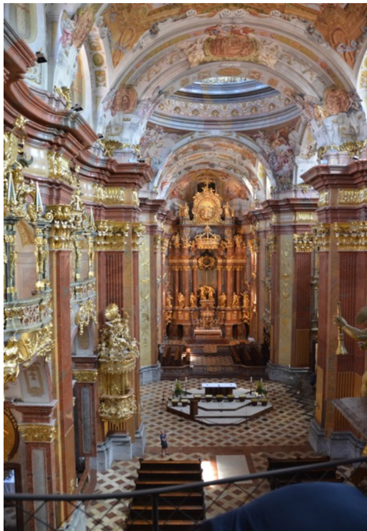
The glorious splendour of the gilded baroque interior of the Melk Abbey.