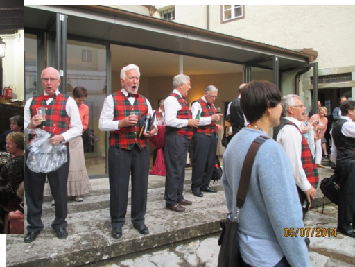
Some serious singing requires lubrication of course!