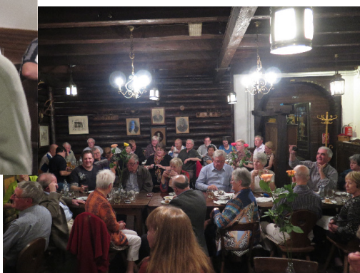
Final Dinner antics