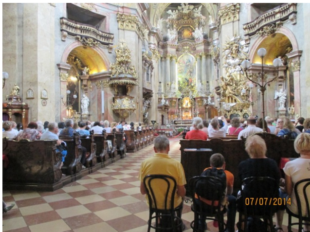
St Peter's Church looking towards the altar. The choir sang from the Altar.