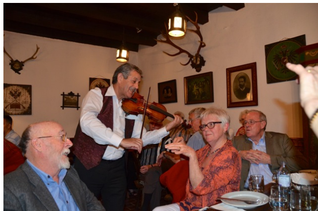
The magic of the serenading violin at a restaurant in Vienna

That evening, we gathered for our last function, a dinner at a traditional Heurigen in Gumpoldkirchen, a village about 40 minutes from Vienna.