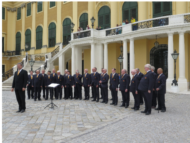
About to perform for the audience at the Schönbrunn Palace.

The following morning we journeyed to Schönbrunn Palace and on arrival at the gates we saw a poster advertising our concert. We had a quick look at the gardens at the rear of the Palace before forming up on the Palace forecourt for the 12:00 noon open-air performance.