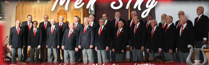
Wanganui Male Choir (NZ)