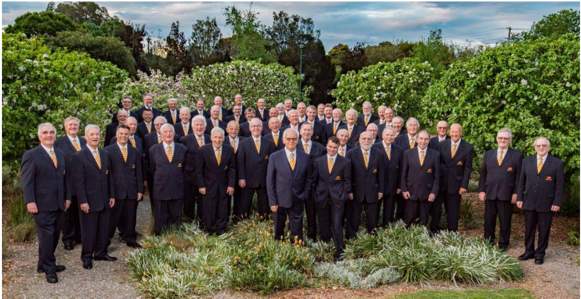
In case you've forgotten what we look like this was take before COVID in the garden at Federation Estate

The choir has had a number of face-to-face rehearsals at Federation Estate so far this month and despite our long absence from singing at the venue and the mandatory use of masks during the session, the choir is sounding good.