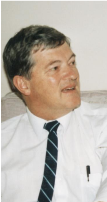
This is me in my stockbroking days

I have always had a love of music and enjoyed singing from an early age.